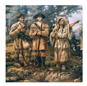
Sacajawea, where did we park the minivan?